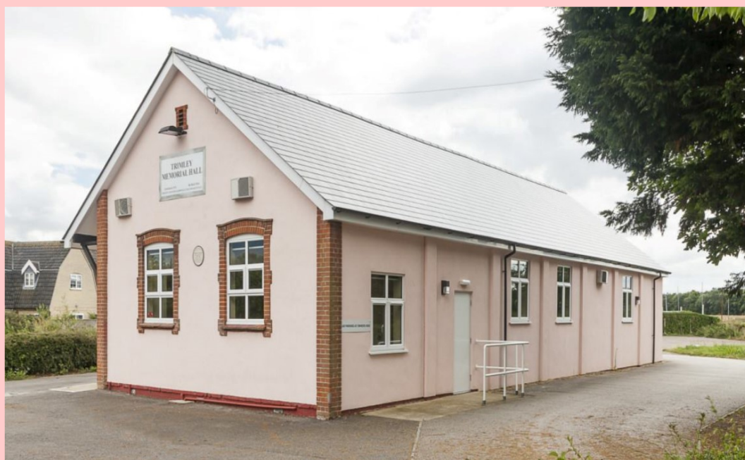
Trimley St Martin Memorial hall - Worship evening Postponed until further notice