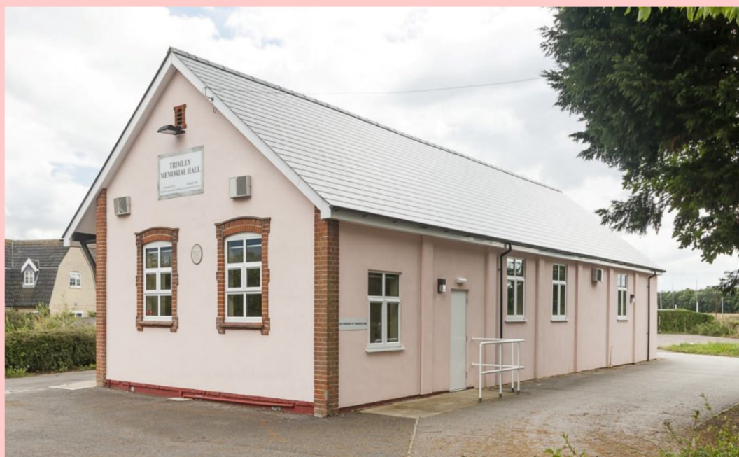
Trimley St Martin Memorial hall - Worship evening Every 4th Saturday of the month.